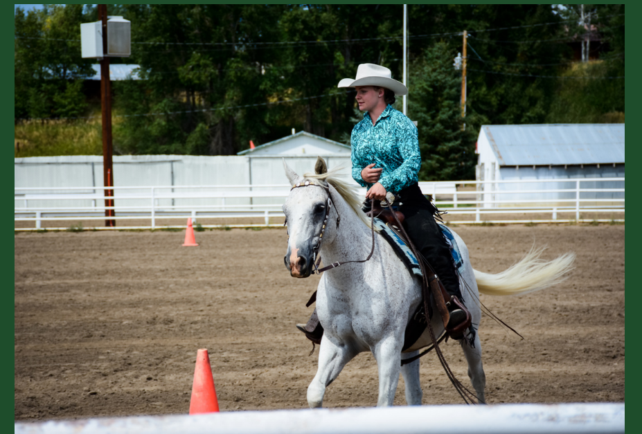
ROUTT COUNTY FAIR